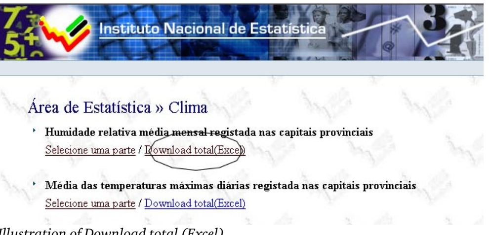
Illustration of Download total (Excel)

The presentation functionality of PX-web was therefore modified so that it is now possible to download Excel files directly from the table selection menu. The changes in presentation functionality also necessitated changes in the logging function and in the search function as it should also be possible to download Excel files directly form the search menu. Normally the use of PXweb (screen presentations and downloads) is counted after the selection process, but direct downloads of Excel files are also counted in the INE installation. Although PX-Web is designed for easy customization, this task did take a significant part of the mission time.