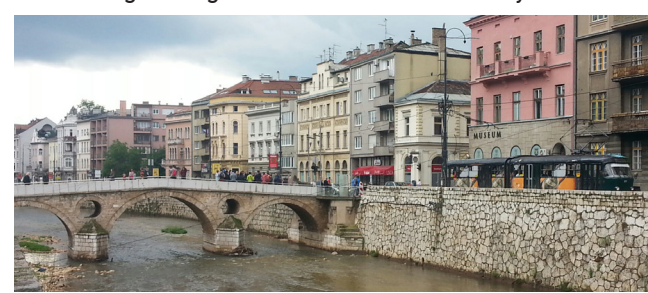
Touring Bosnia & Herzegovina on one of many missions.