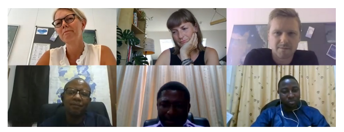
Virtual engagement regarding the drafting of a Data Quality Assurance Frame-

The strategic sector cooperation between Ghana Statistical Service (GSS), Statistics Denmark (SD) and the Ministry of Foreign Affairs (MFA) lays down the foundation for a statistical system that should ultimately be based on fewer surveys, while at the same time ensuring more data and higher data quality. This is to strengthen the foundation for evidence-based decision making in Ghana and improving monitoring and reporting of the UN SDGs.