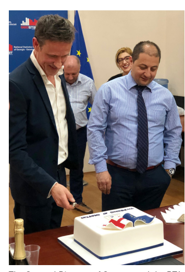
The General Director of Geostat and the RTA opened the Twinning project two years ago with cake and champagne.

project is pleased to assist on those issues as well, and look forward to continue with the training sessions in "R" software, assist in finalising the development of a Harmonized Index of Consumer Prices, read the Geostat IT strategy built upon the IT-sector review in which the Twinning project participated, and to assess the possibilities of developing Georgian Satellite Sports Accounts